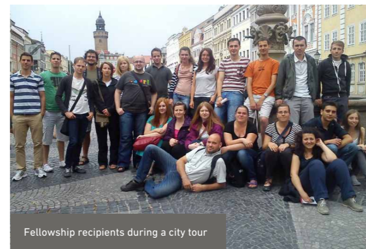
Fellowship recipients during a city tour