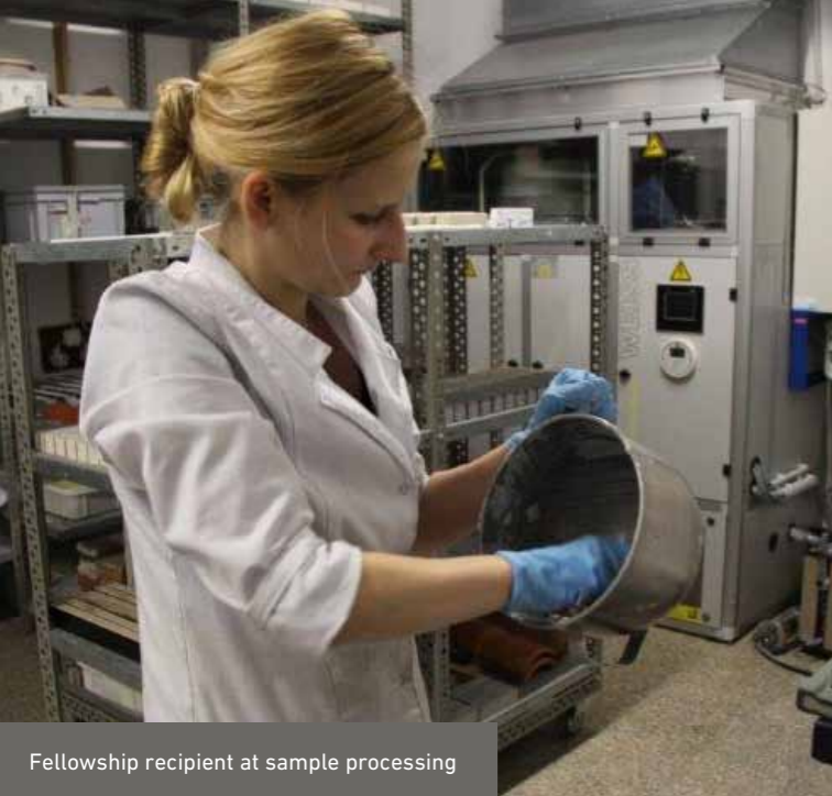
Fellowship recipient at sample processing