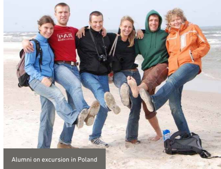
Alumni on excursion in Poland

During the fellowship practical solutions for current environmental issues are developed. After their stay in Germany the alumni are well qualified to tackle these issues in their home countries thus assuring efficient knowledge transfer. Working closely together in an international context helps to breakdown existing barriers. The acquired contacts will create a strong network of highly committed environmental experts.